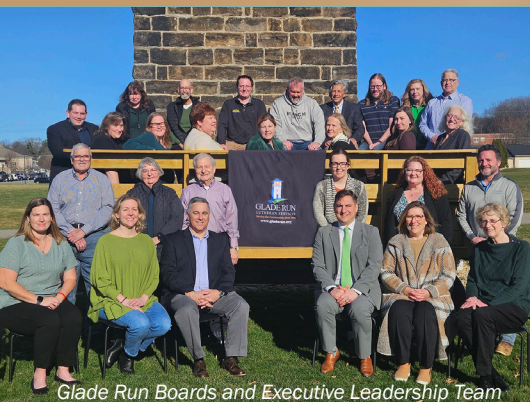
Glade Run Boards and Executive Leadership Team